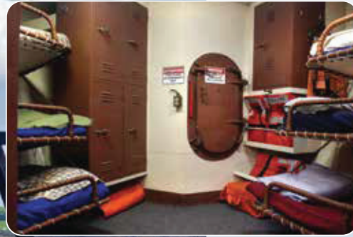
Berthing for 5 scientific crew plus Captain and First Mate