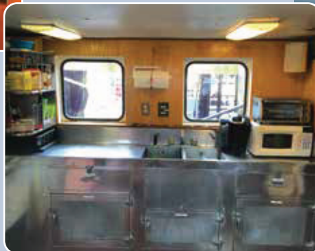
Full Galley capability