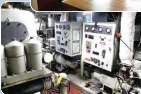
Engine Room: Main propulsion: (1) CAT D375 500 HP Electrical Power: (2) CAT C311 20 KW 120/240/450 VAC 60 Hz