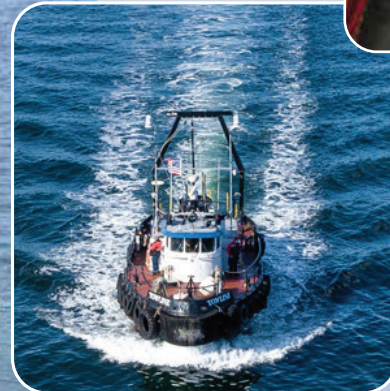
1800 gallon fuel capacity with a navigational range of 3200 NM at 7 knots